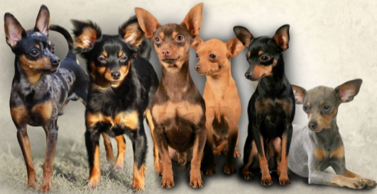
Black & tan merle, long-haired black & tan, brown & tan, yellow, black & tan, blue & tan

Tan-markings are preferably a deep reddish tan, except in the blue varieties where it is paler according to the genetic make-up. Tan-markings are found above the eyes, on cheeks, chest, pasterns and feet, also at inner side of the hindquarters and under the root of the tail. On the forechest it forms two similar and separated triangles.